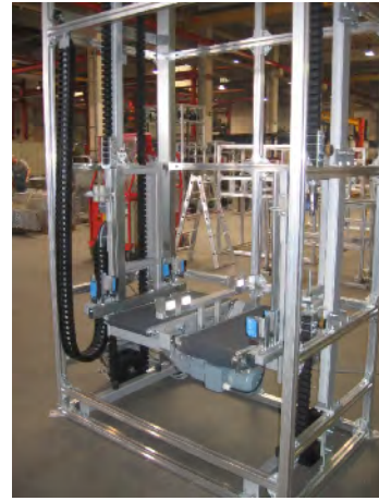
Console with two mounted belt conveyors side by side