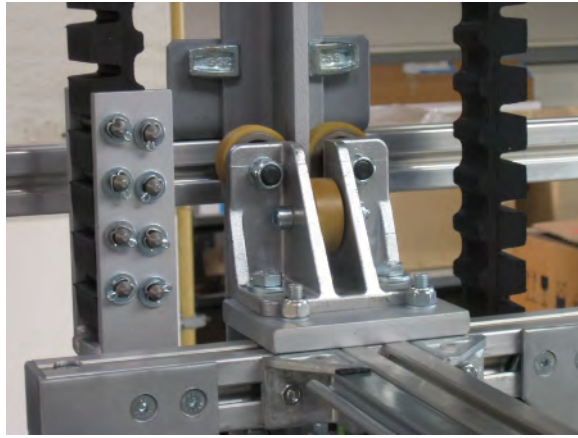
Arrangement of guide rollers