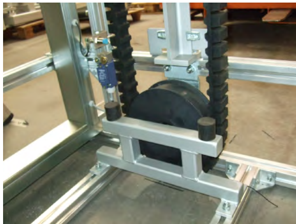
Bottom idler unit