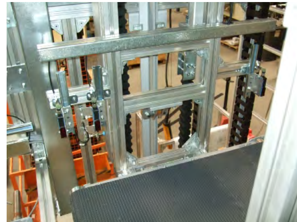
Console with belt conveyor