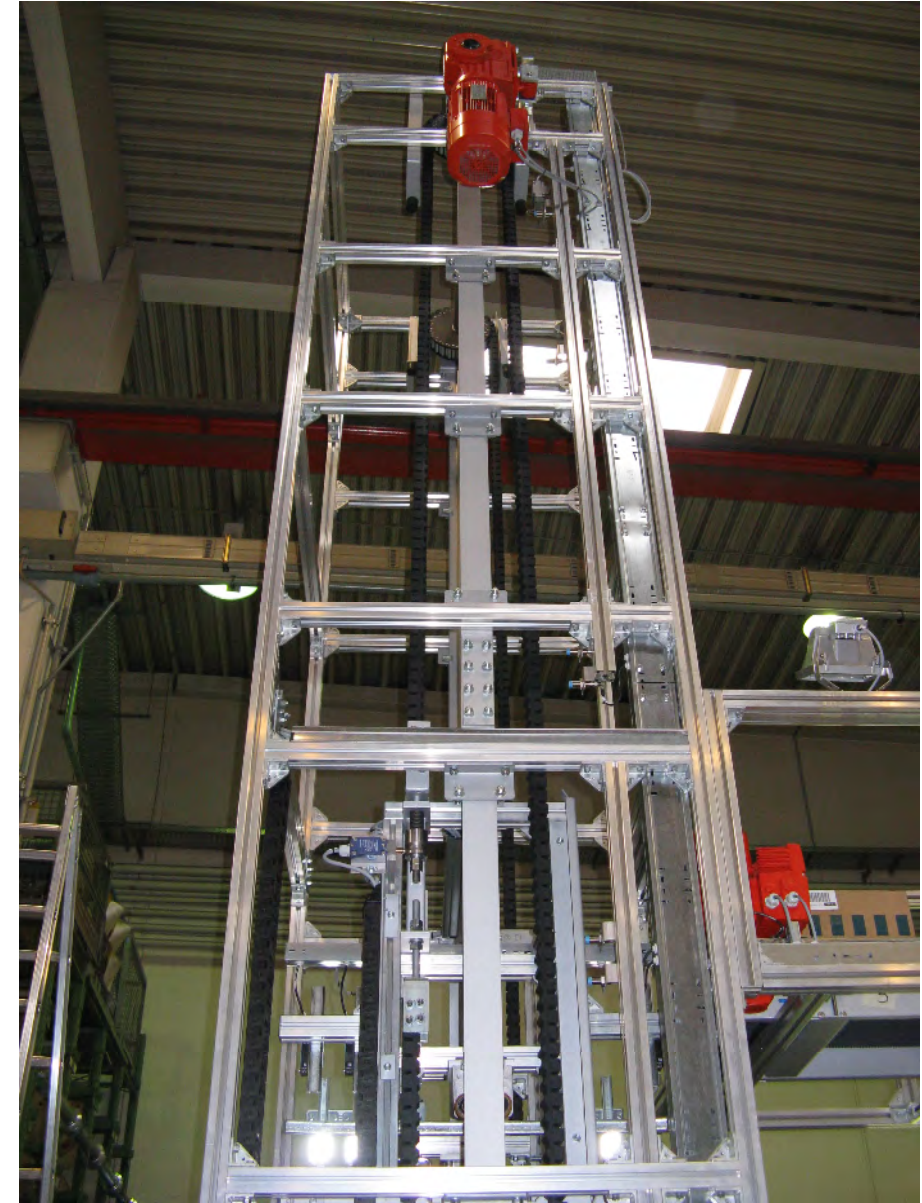
Type: PH253/33/50-All For individual loads up to 200 kg

This type of conveyor has a supporting frame made from aluminium profiles that accommodate the guide rails, the protective cladding as well as the drive and idler units.